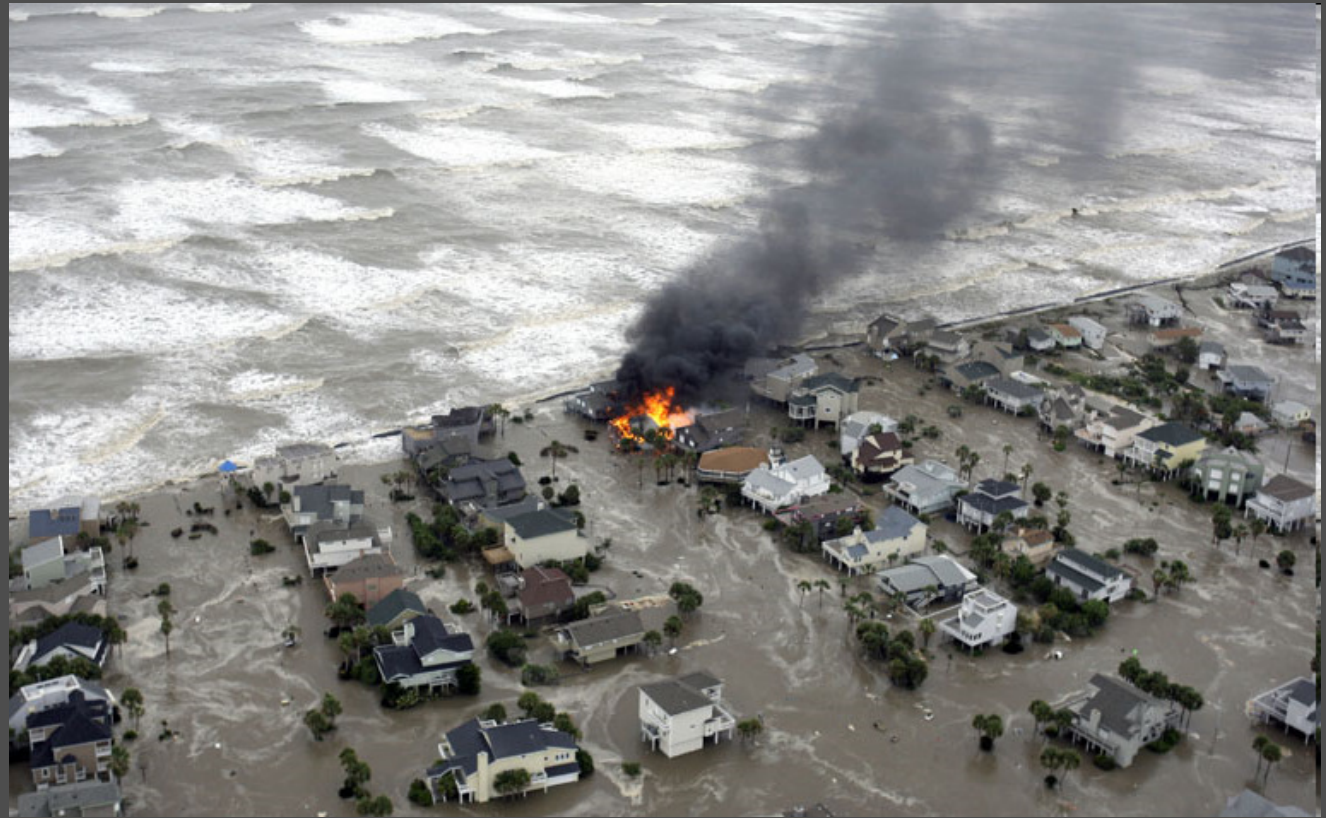
Galveston Island, Texas as Hurricane Ike approaches 12 Sep 2008.

1 The big drivers that won't go away -- peak oil & climate change